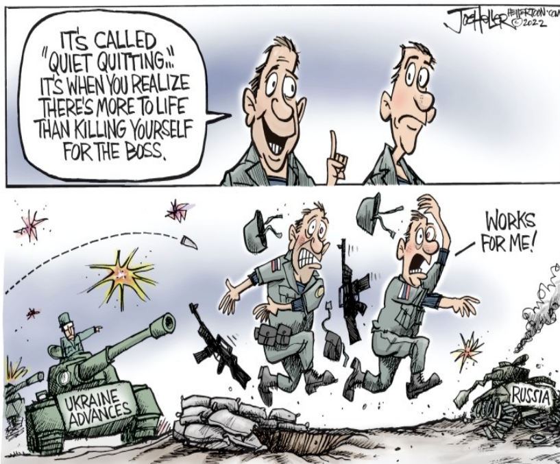
Joe Heller, Green Bay Press-Gazette / Courtesy of Cagle.com