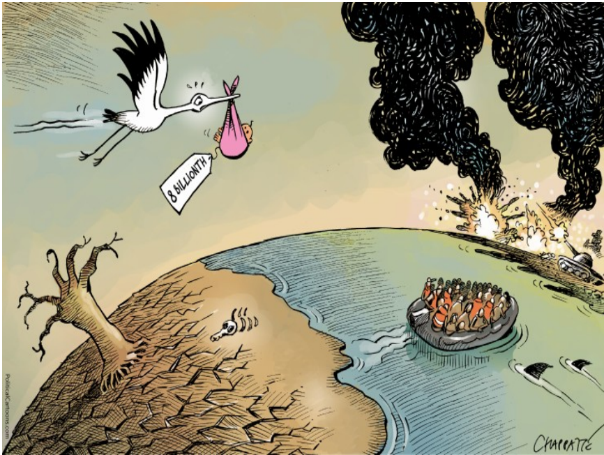
Patrick Chappatte / Courtesy of Cagle.com