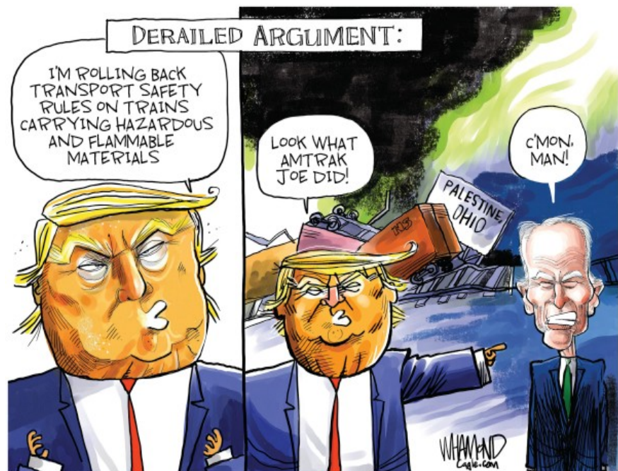
Dave Whamond