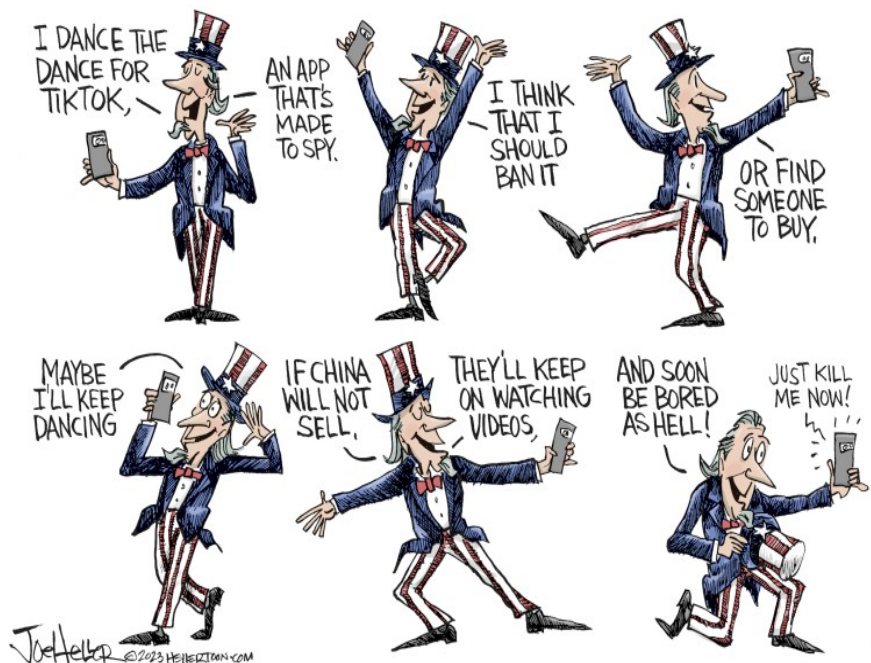
Joe Heller, Green Bay Press Gazette / Courtesy of Cagle.com