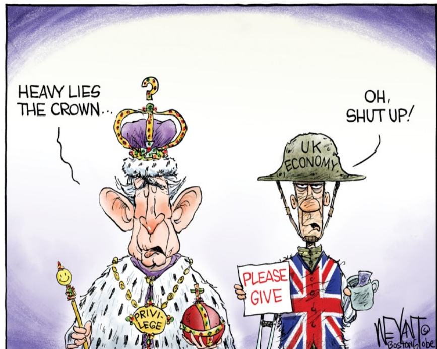
Chris Weyant / Courtesy of Cagle.com