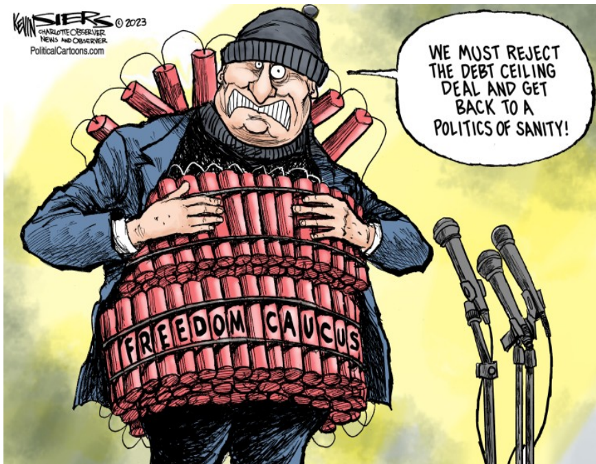
Kevin Siers, The Charlotte Observer / Courtesy of Cagle.com