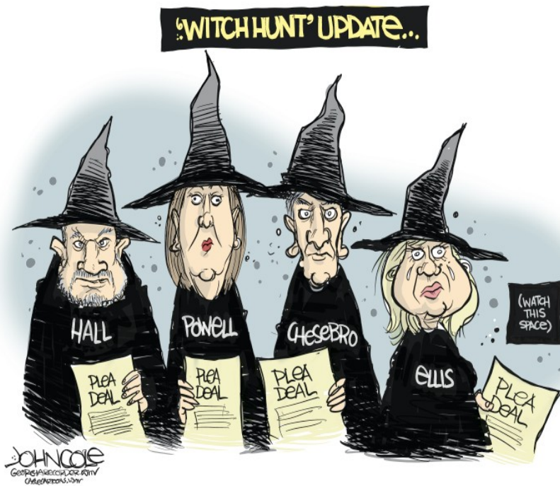
John Cole / Courtesy of Cagle.com