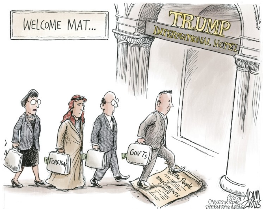
Adam Zyglis, The Buffalo News / Courtesy of Cagle.com