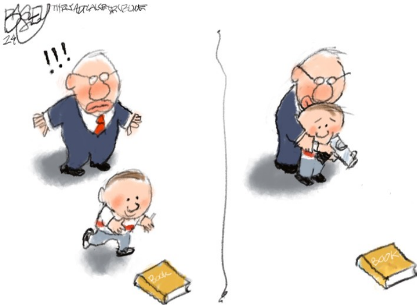
Pat Bagley, Salt Lake Tribune / Courtesy of Cagle.com