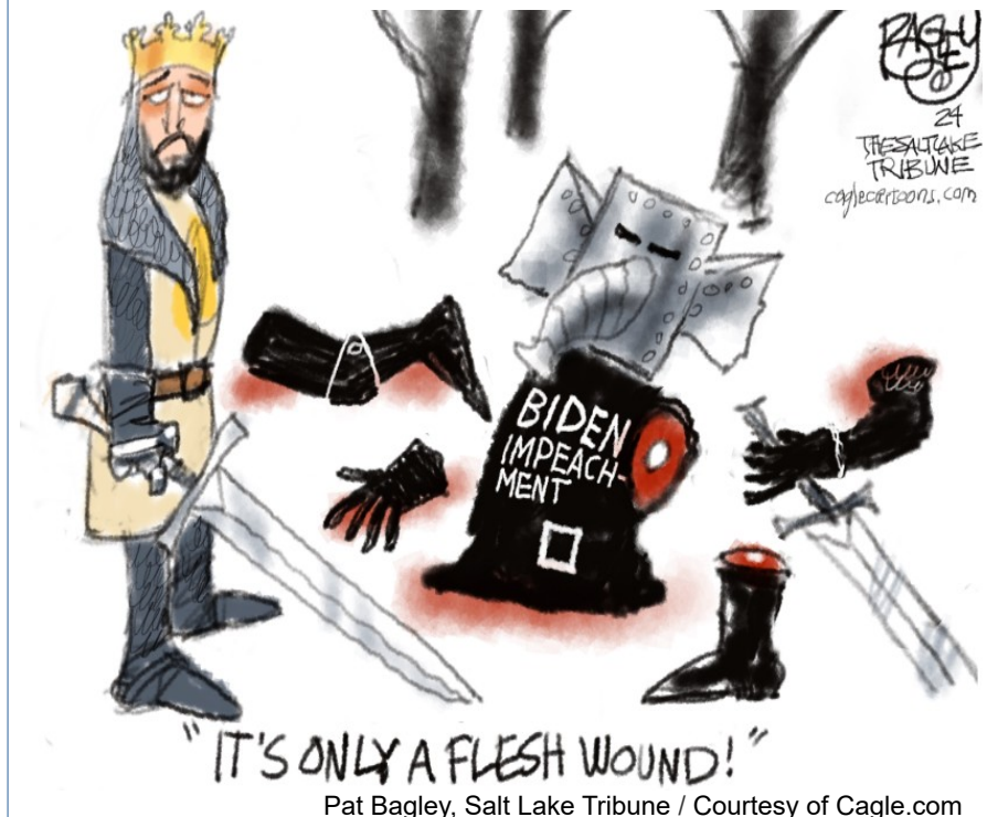
Pat Bagley, Salt Lake Tribune / Courtesy of Cagle.com