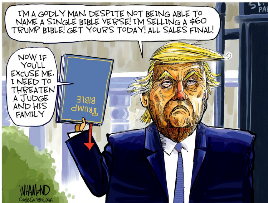
Dave Whamond