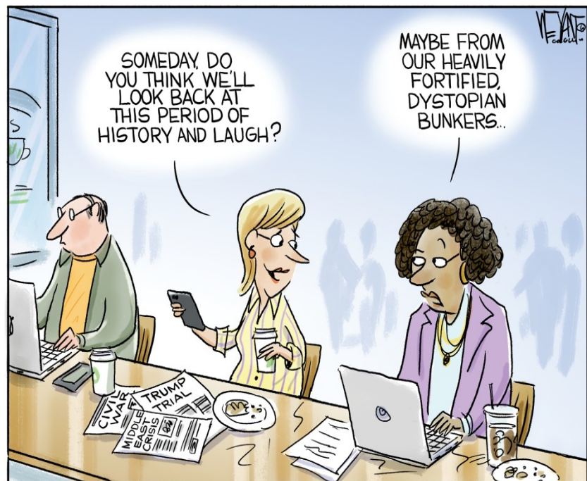
Christopher Weyant / Courtesy of Cagle.com