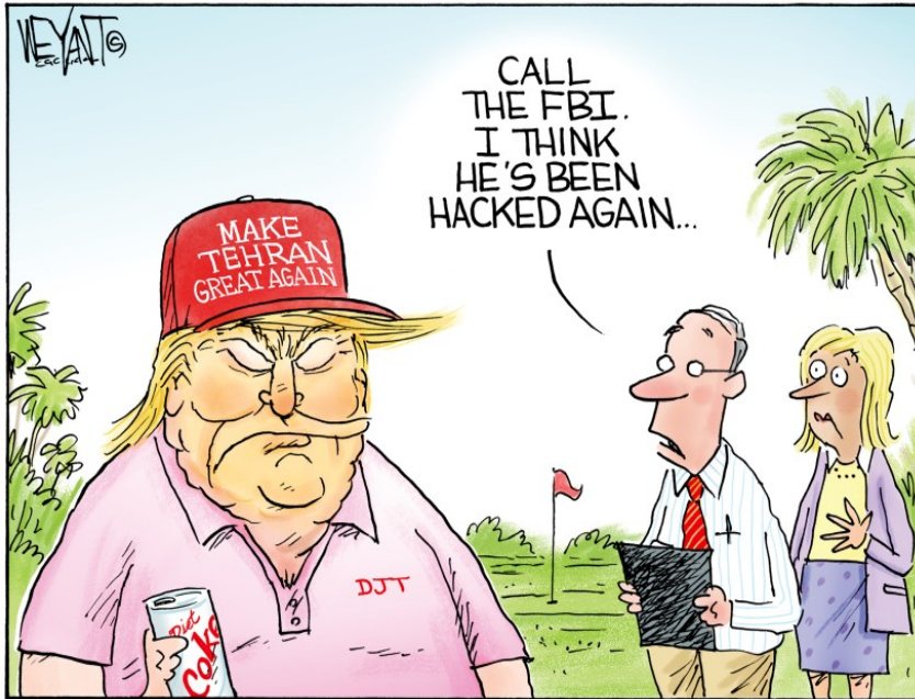
Chris Weyant / Courtesy of Cagle.com