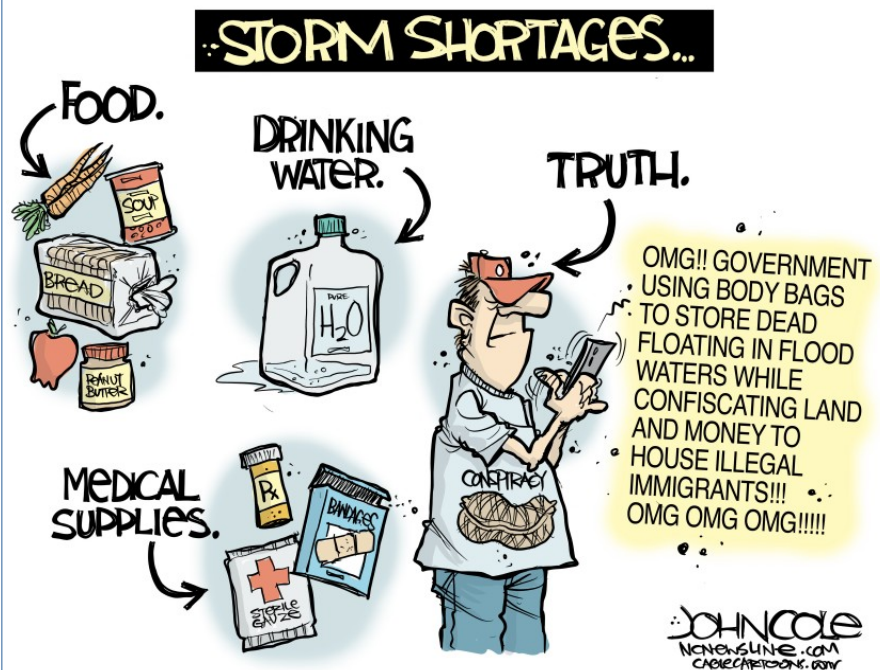
John Cole / Courtesy of Cagle.com