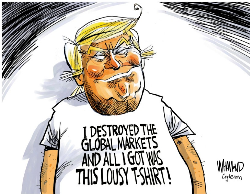
Dave Whamond / Courtesy of Cagle.com