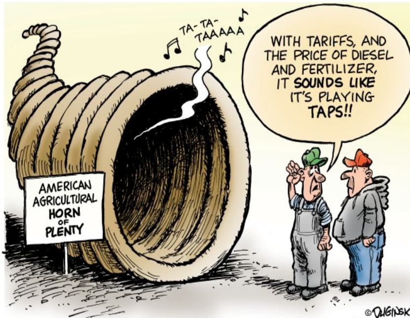
Paul Duginski / Courtesy of Cagle.com