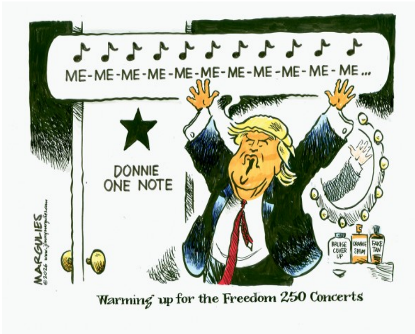
Jimmy Margulies / Courtesy of Cagle.com