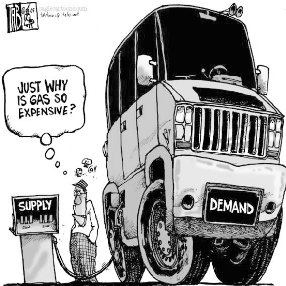
Tab / The Calgary Sun