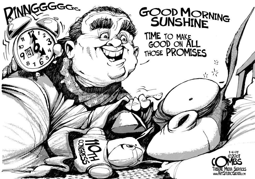
Cartoon Courtesy Paul Combs /Tribune Media