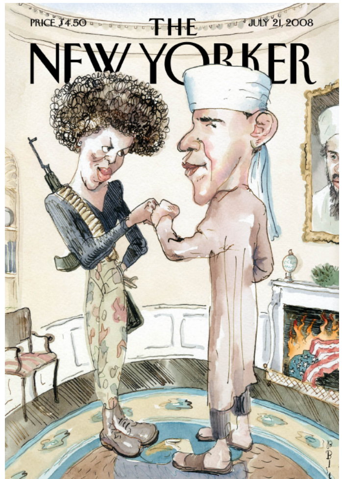
Barry Blitt / New Yorker Magazine, July 21, 2008