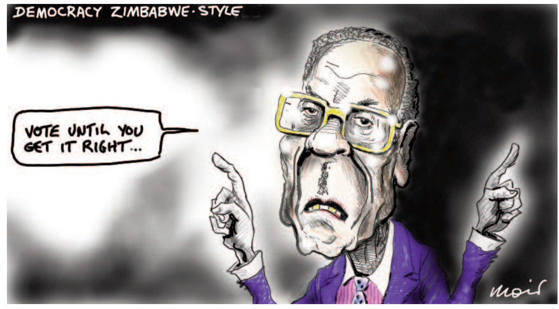
Both cartoons courtesy Alan Moir / Sydney Morning Herald, Australia

Results of the March 29, 2008 elections in Zimbabwe were delayed for weeks by President Robert Mugabe's government. The results ultimately showed that the main opposition party had won the election, but not by the necessary margin of more than 50 percent. A runoff election will determine whether Mugabe will remain in power.