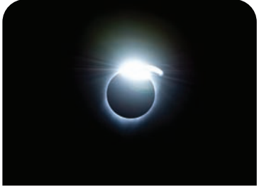
The diamond ring effect during the 2017 total solar eclipse.

than an hour. As the eclipse becomes total, the last bits of sunlight streaming through valleys on the moon cause a bright flash, known as