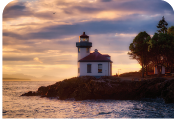
A lighthouse on San Juan Island

The San Juan Islands, which lie off the coast of Washington near the Canadian border, are popular tourist spots, with whale-watching, kayaking and hiking activities.