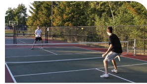
Pickleballers at play

Do you know anyone who plays pickleball? The sport was invented on Bainbridge Island in Washington in 1965.