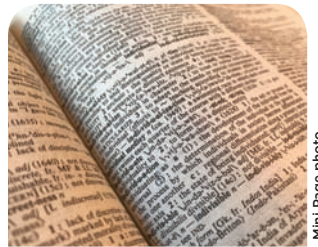
Mini Page photo

Noah Webster's dictionary took 27 years to write. He had to do a lot of research. Most of the words we use today come from other languages, such as Latin or French. Webster learned 26 languages so that he could figure out the origins of our words.