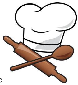
* You'll need an adult's help with this recipe.