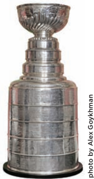
The Stanley Cup

The National Hockey League's championship Stanley Cup is named after Lord Stanley of Preston, who was Canada's governor-general from 1888 to 1893.