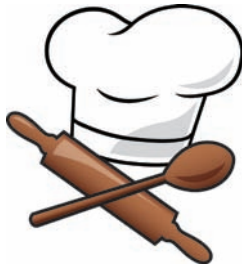
* You'll need an adult's help with this recipe.