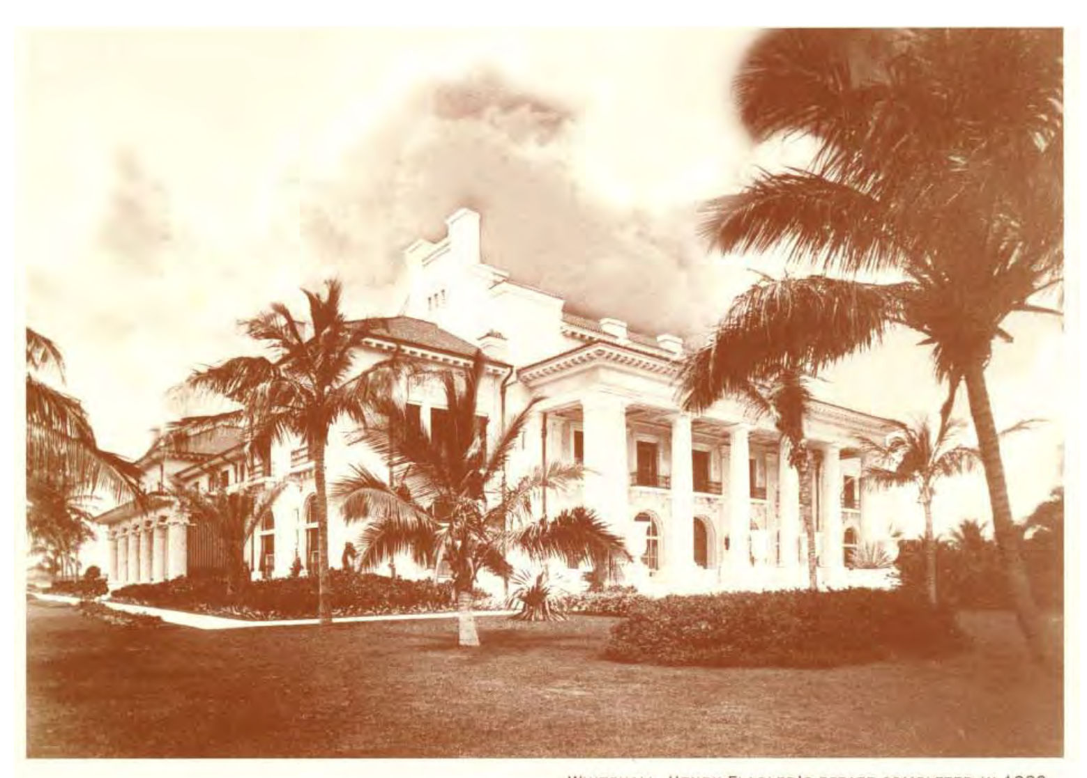
WHITEHALL, HENRY FLAGLER'S ESTATE COMPLETED IN 1902