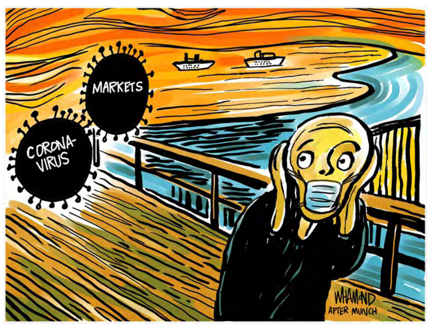
Dave Whamond / Courtesy of Cagel.com