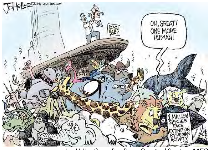
Joe Heller, Green Bay Press-Gazette / Courtesy AAEC