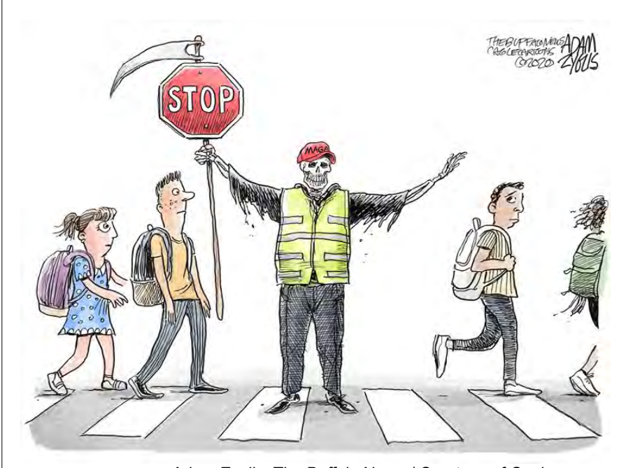
Adam Zyglis, The Buffalo News / Courtesy of Cagle.com