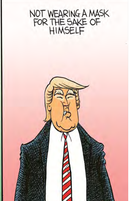
Bruce Plante / Courtesy of Cagle.com