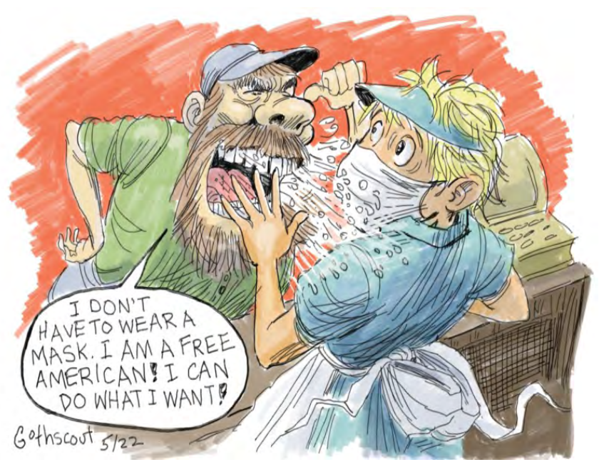
Elena Steier / Courtesy of AAEC