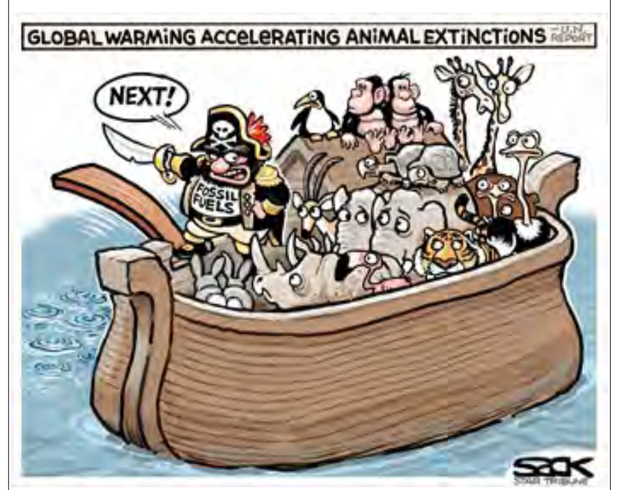
Steve Sack, Minneapolis Star Tribune / Courtesy of Cagle.com