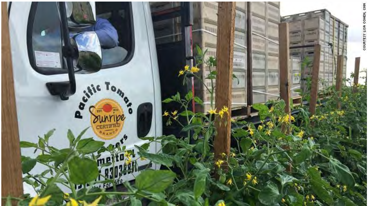
A truck on a tomato farm in Immokalee.

"We began to come across situations where workers were being held against their will, where they weren't free to leave," Germino says.