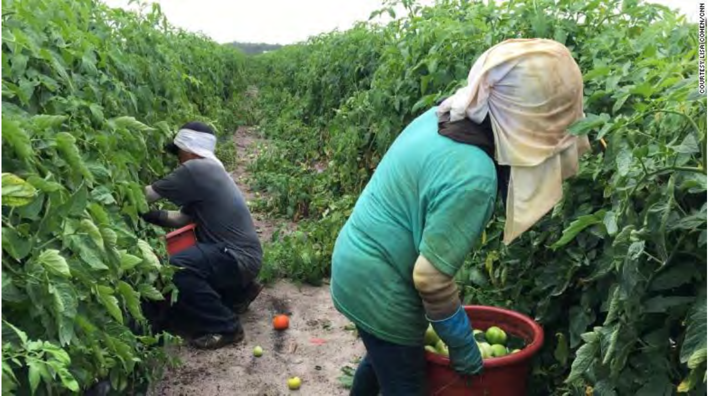
Workers pick tomatoes on a farm in Immokalee, Florida.

The program also includes real market consequences for farms if violations are found.