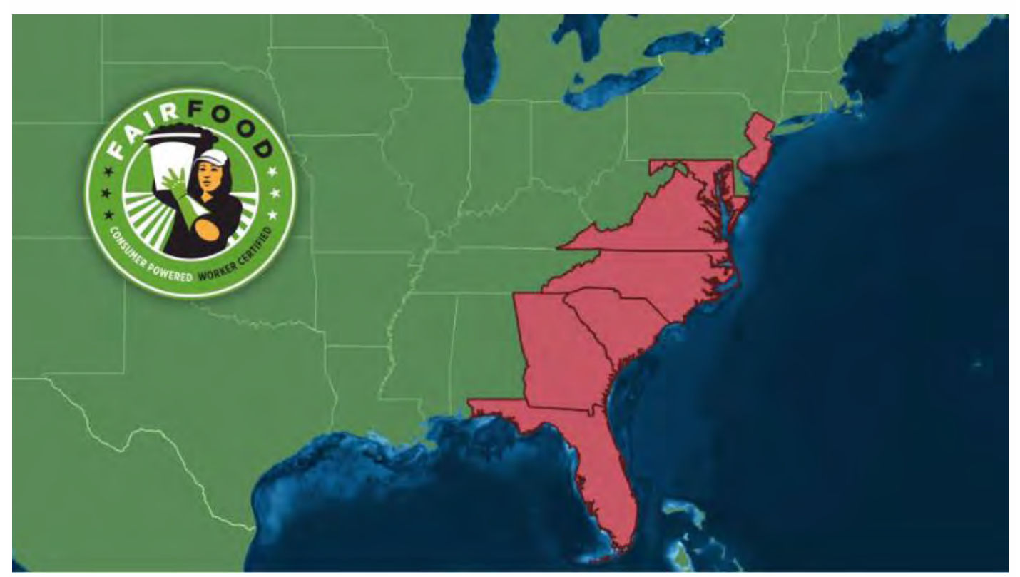
The Fair Food Program operates in Florida, Georgia, South Carolina, North Carolina, Maryland, Virginia and New Jersey.

The growers also agree to regular third-party inspections of their farms. When they visit, a team of auditors speaks confidentially with at least 50% of workers to ensure their rights are being respected.