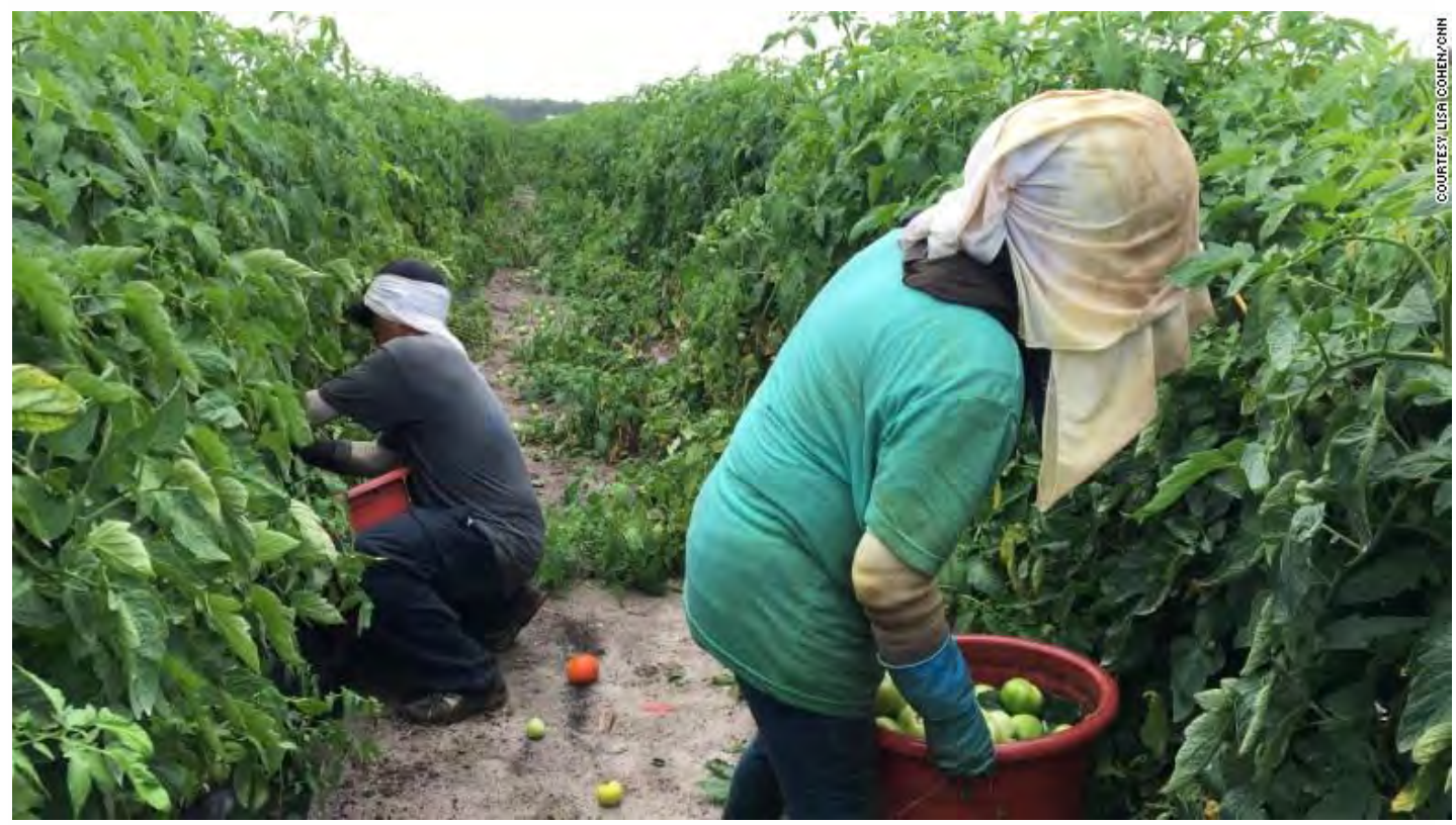
Workers pick tomatoes on a farm in Immokalee, Florida.

The program also includes real market consequences for farms if violations are found.