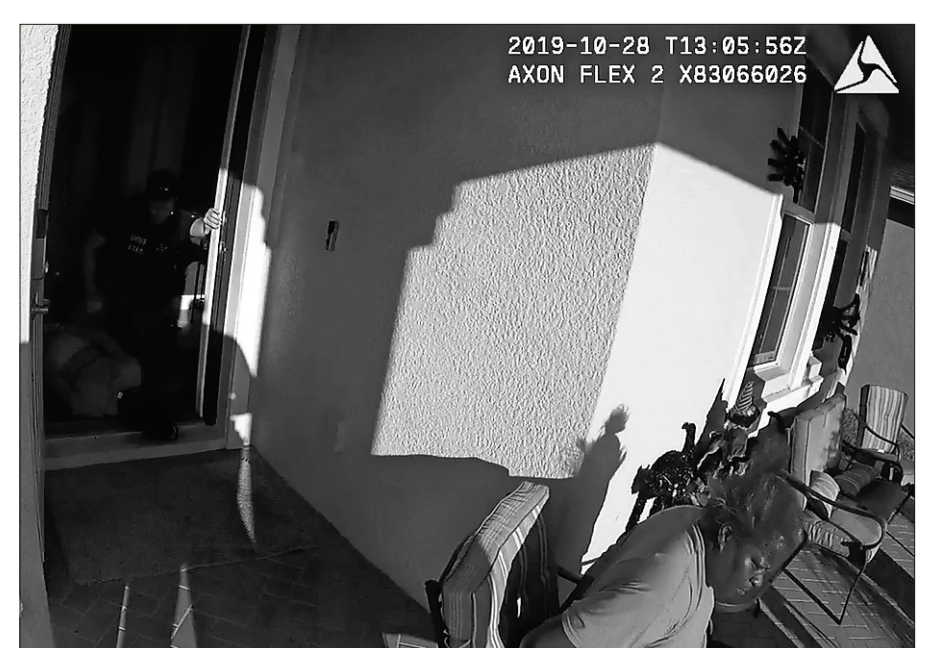
Deputies handcuffed Da'Marion Allen's family members at their front door in October 2019.

ily who felt harassed. One night, deputies showed up at